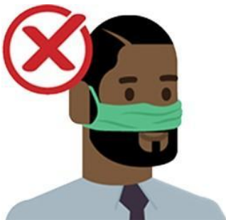
Only on your nose