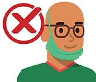
On your chin