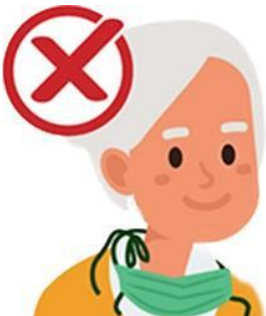
Around your neck