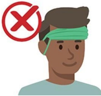
On your forehead