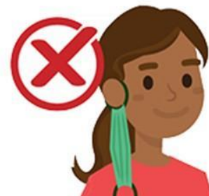
Dangling from one ear