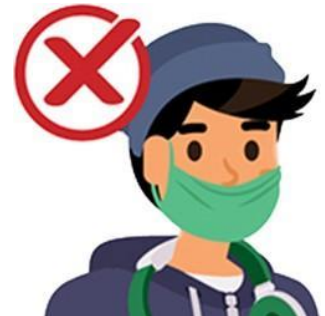
Under your nose